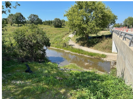
South bank of the creek being restored after the disturbance of installing a flared end section