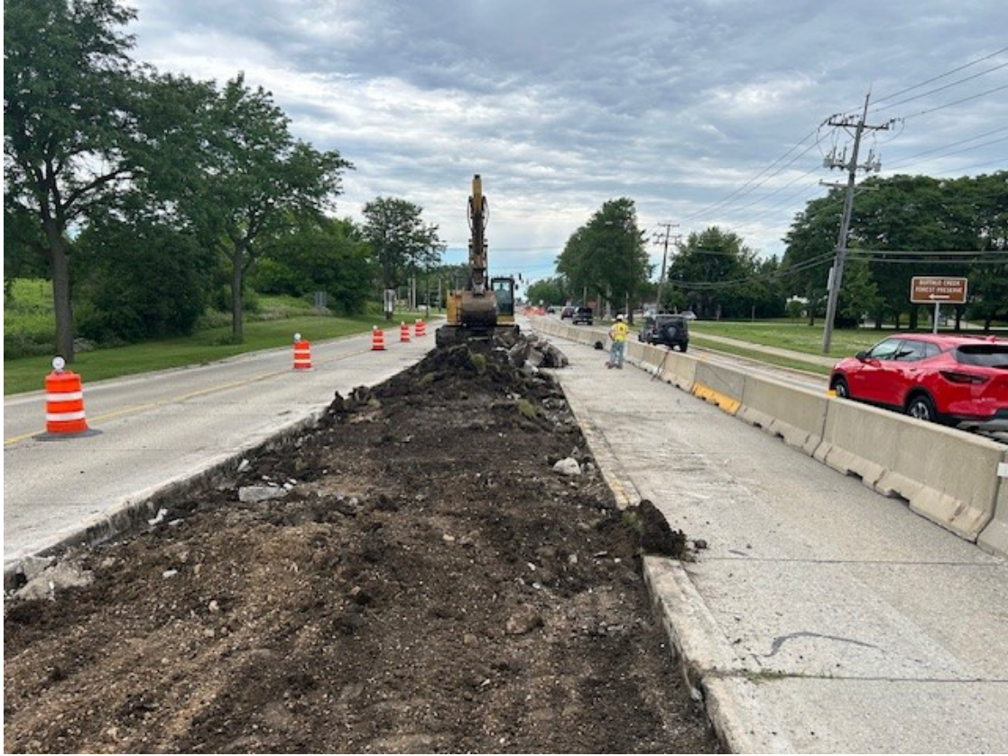
Median pavement removal on Arlington Heights Road