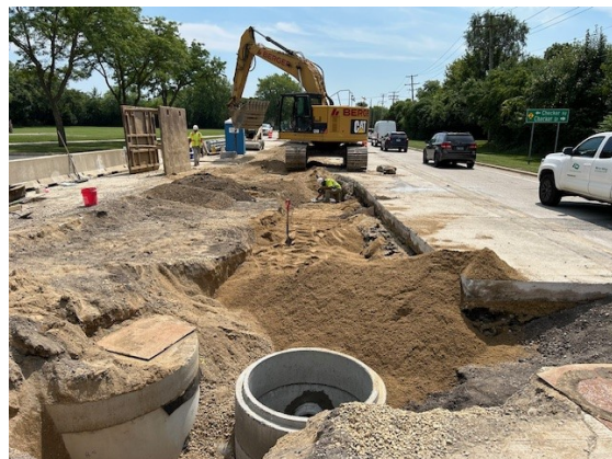
Storm sewer installation