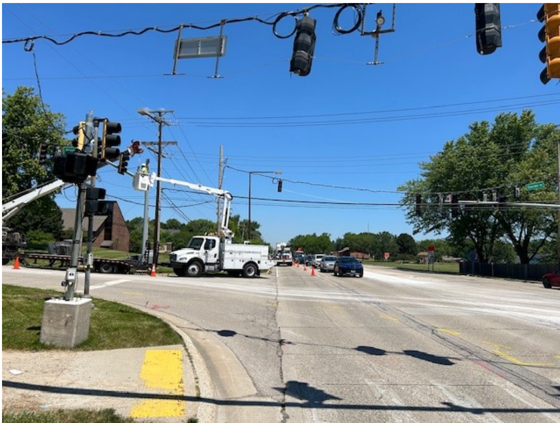
Temporary traffic signals being installed on Checker Road

The contractor strongly advises drivers to take alternate routes and for drivers to exercise caution when traveling through the project area.