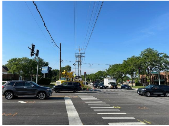
Temporary traffic signals installed