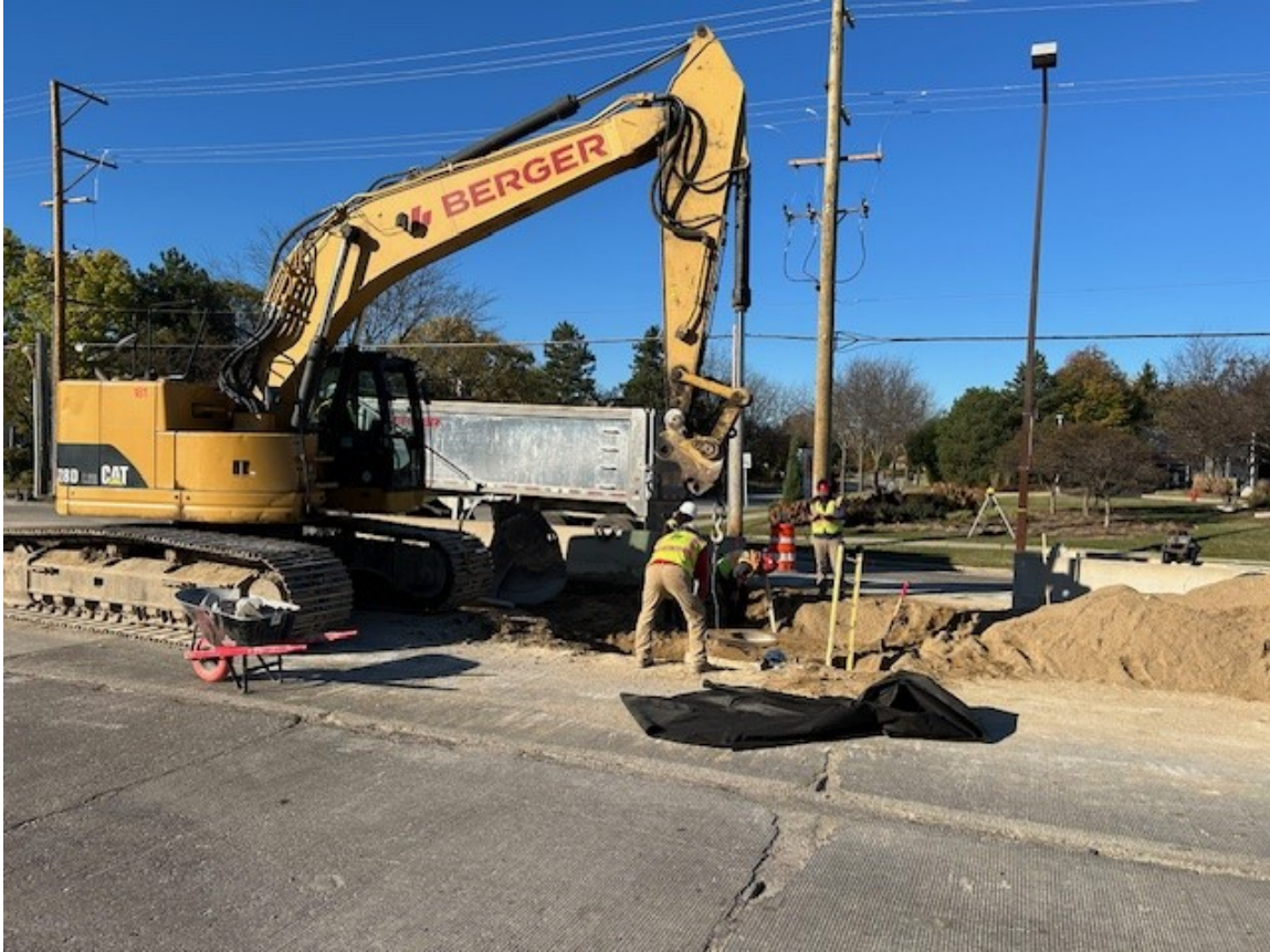
Storm laterals installation