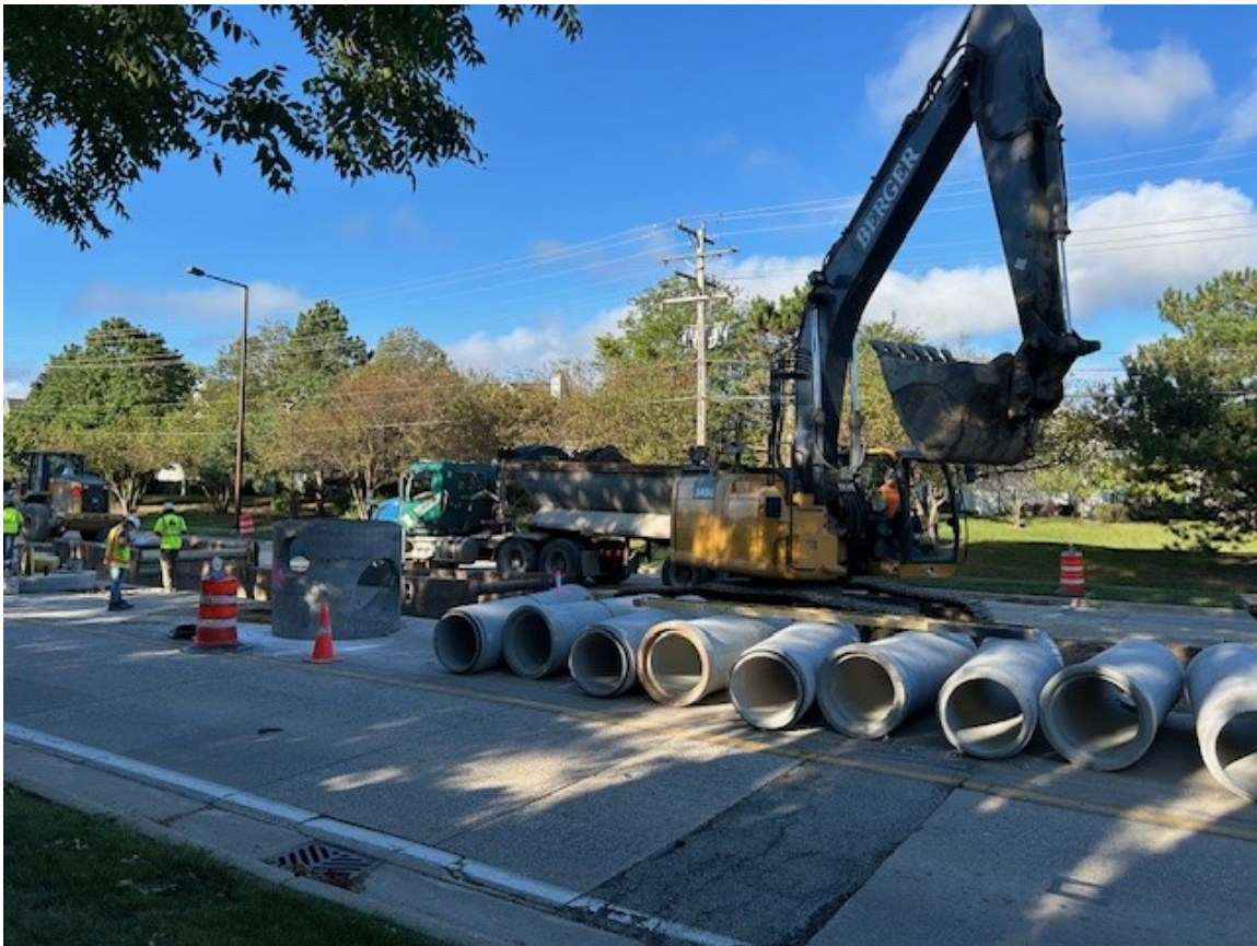
Installing 24" storm sewer pipes on the centerline of Arlington Heights Road